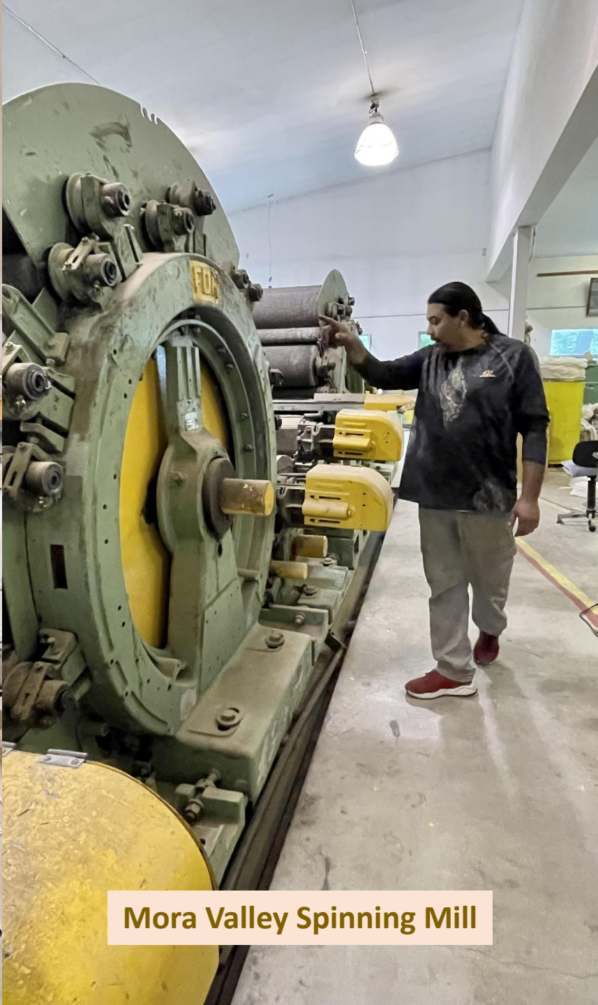
Mora Valley Spinning Mill