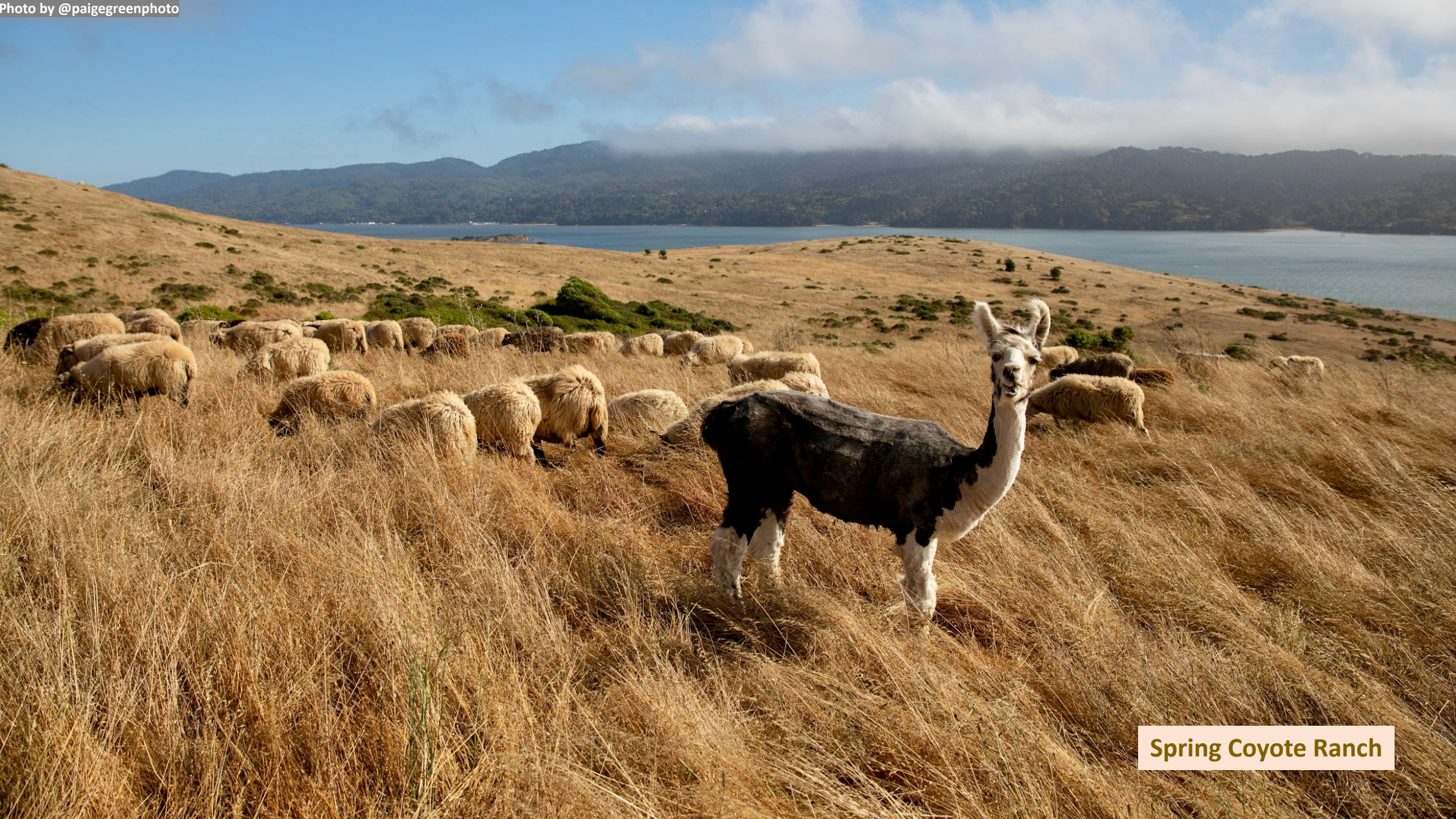
Spring Coyote Ranch